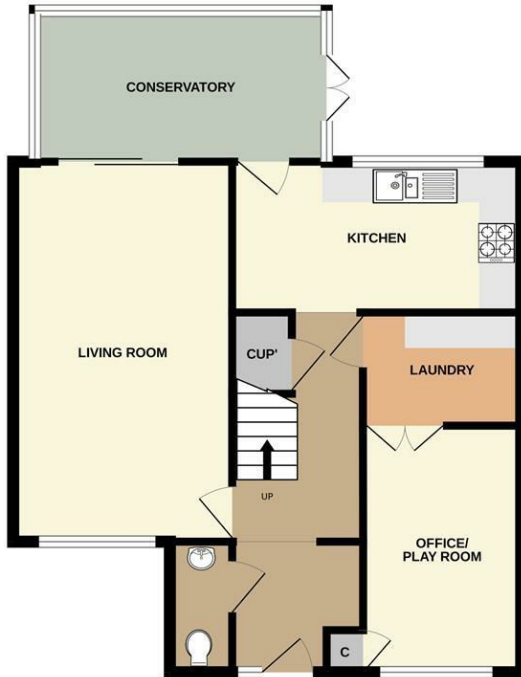
GROUND FLOOR 676 sq.ft. (62.8 sq.m.) approx.